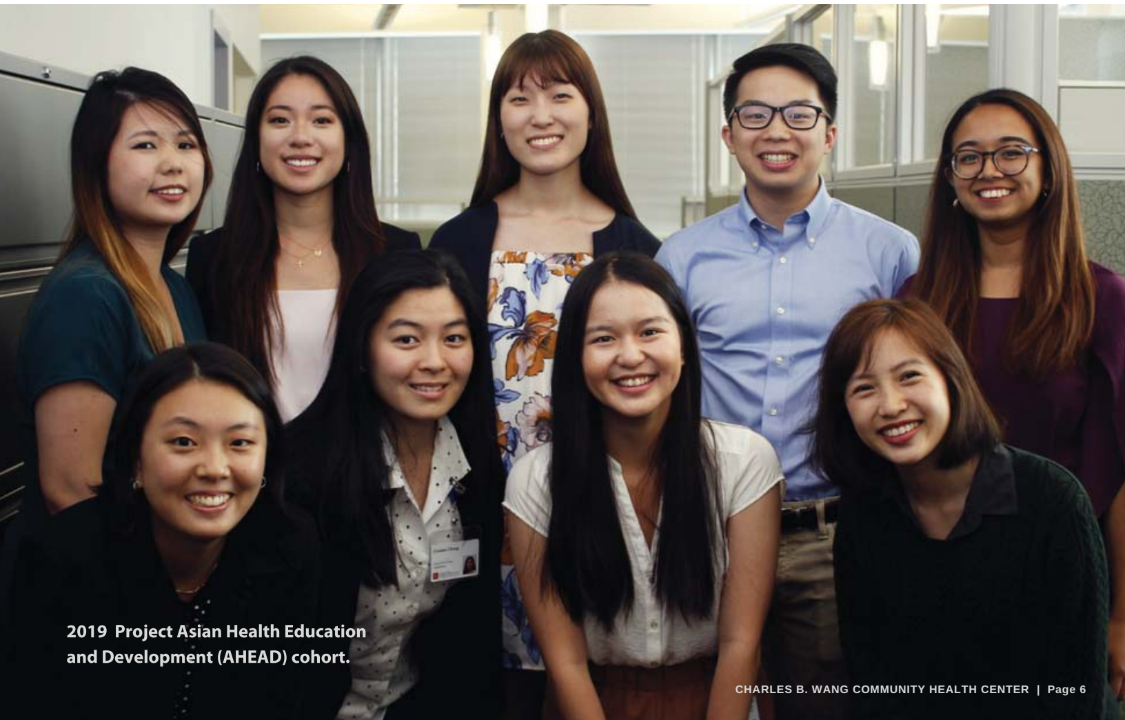
2019 Project Asian Health Education and Development (AHEAD) cohort.